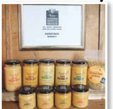
Sweetree Honey is not blended so remains true to the area in which it was harvested.